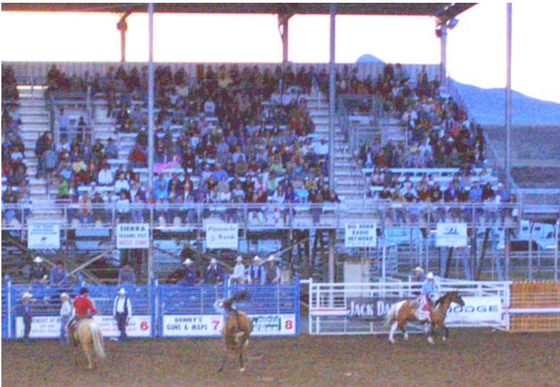
Left: A bonus was watching a rainbow and the sunset.