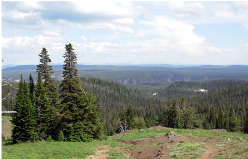
Dunraven Pass named after the Earl of Dunraven, who Texas Jack led on a hunting trip.